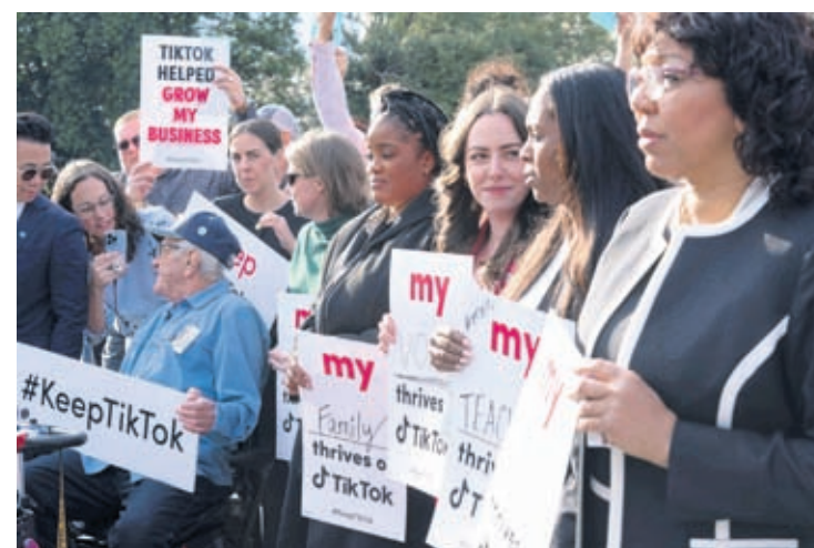
Supporters of TikTok hold signs during a rally to defend the app, Wednesday, March 22, 2023, at the Capitol in Washington. The House holds a hearing Thursday, with TikTok CEO Shou Zi Chew about the platform's consumer privacy and data security practices and impact on kids.

"I want to say this to all the teenagers out there, and TikTok influencers who think we're just old and out of touch and don't know what we're talking about, trying to take your favorite app," said Republican Rep. Dan Crenshaw during the